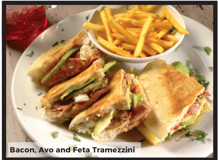
Bacon, Avo and Feta Tramezzini